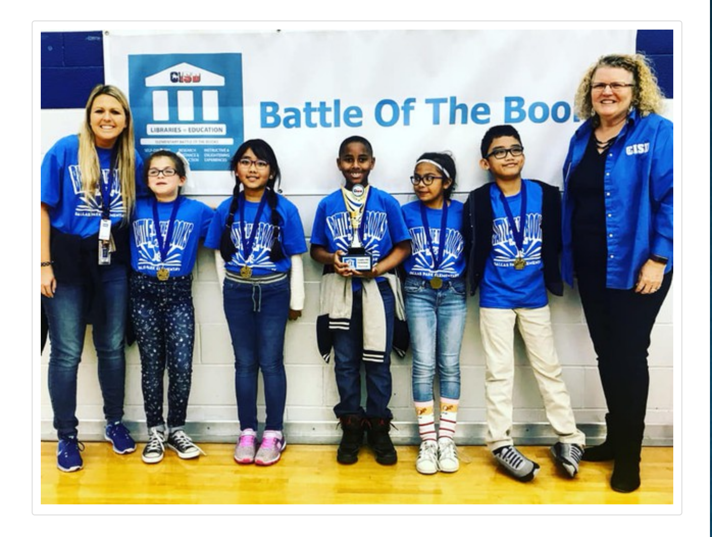
Dallas Park Elementary Third-Grade Panther Readers